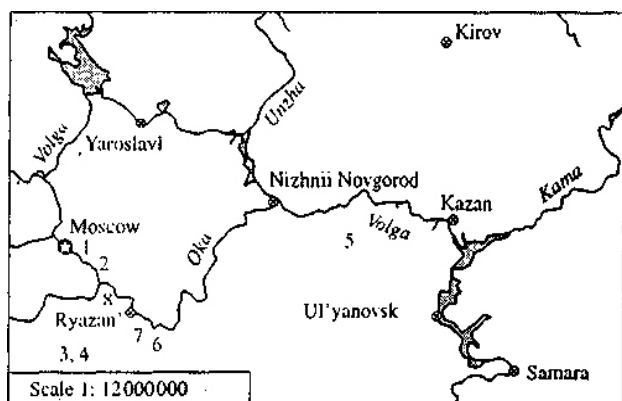
Fig. 1. Ammonoid localities, 1—quarry near the village of Gzhel', 2—quarry near the village of Peski, 3—quarry Mikhailovtsement, 4—quarry Gorenki, 5—quarry near the village of Uzhevka, 6—bank of the Oka River near the village of Nikitino, 7—bank of the Raka River near the village of Boloshnevo, 8—bank of the Oka River near the village of Alpa'eva

(quarries of the factories Mikhailovtsement and Spartak near the town of Mikhailov (Mikhailov District) and natural outcrops on the Oka River (near the village of Nikitino (Spassk District) and on the Raka River near the village of Boloshnevo, Ryazan' District and Nizhni Novgorod Region (quarry near the village of Uzhevka, Pochinkovskii District) (Fig. 1).